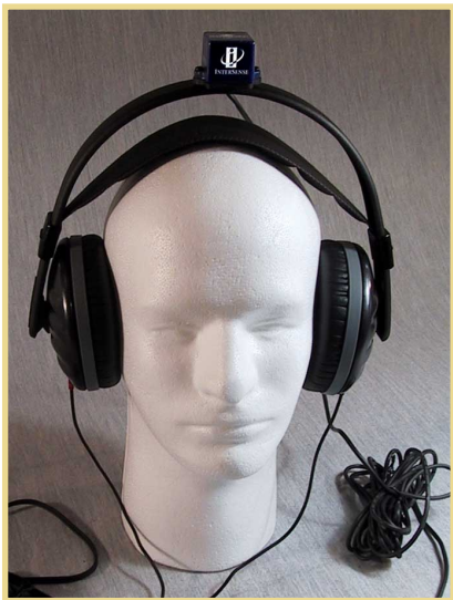
AuSIM headphones, with standard head-orientation tracker mounted on the headband

GoldServe™ is a complete 3D sound-localization server subsystem to be a peripheral to one or more "host" computers running a user's applica-