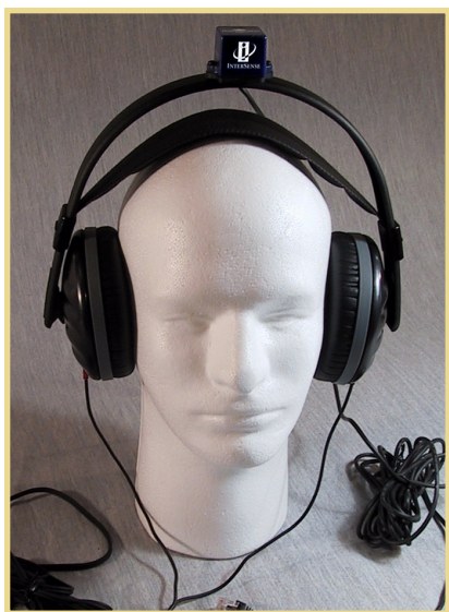
AuSIM headphones, with standard head-orientation tracker mounted on the headband

GoldServe™ is a complete 3D sound-localization server subsystem; a peripheral to one or more "host"